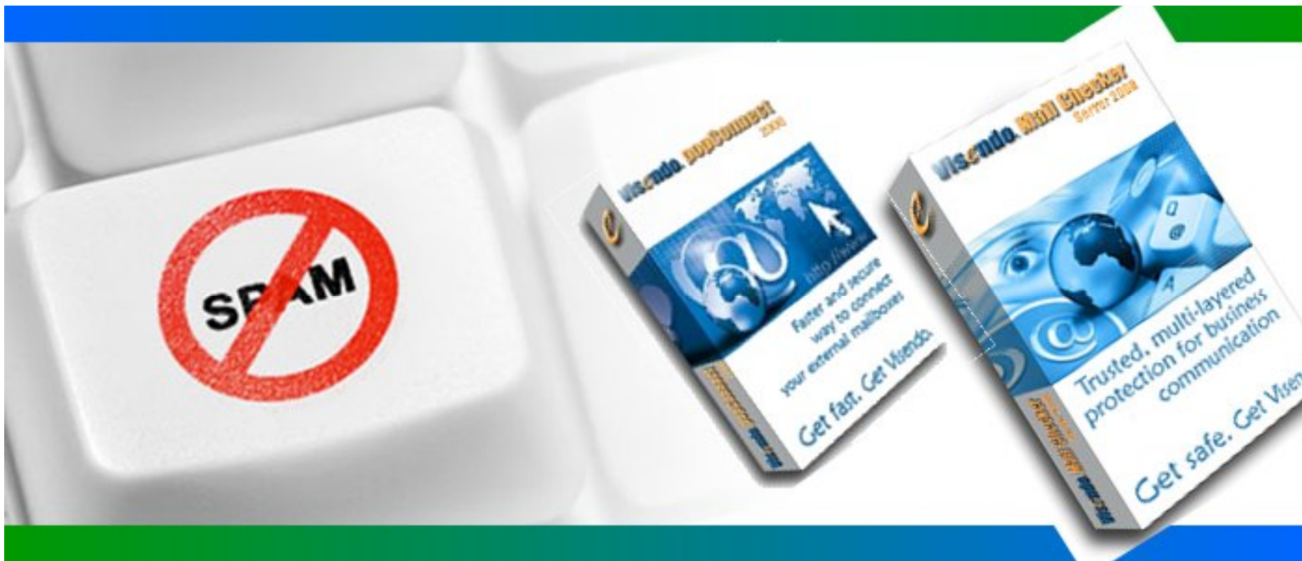
Visendo Email Suite – a reliable solution for SMBs